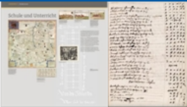
Educational System and Kepler's quarterly Report