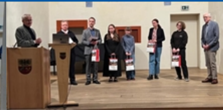
In the Kösterle in Weil der Stadt