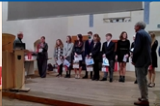
Ceremony Award on November 17 th , 2023