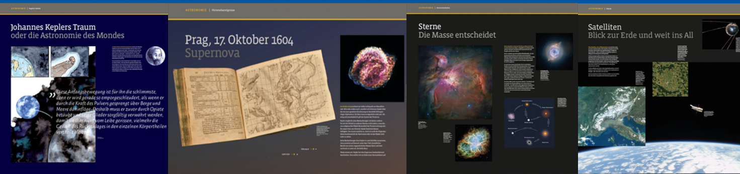
Some display panels from the interactive exhibition "himmelwärts" (Towards heavens)